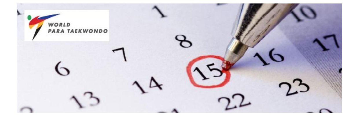
2023 (Provisional calendar subject to change)

• Virtus Global Games (TBC) - June 9-10 - Vichy, France