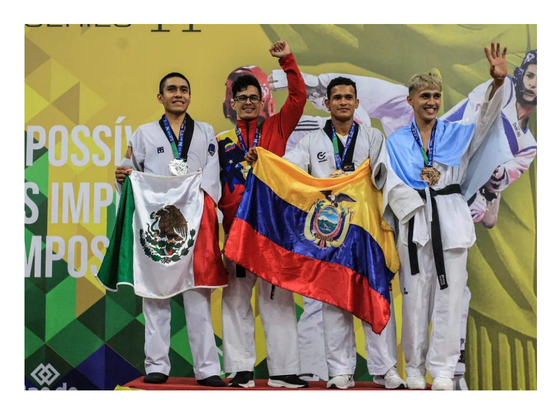
Bipartite slots for Continental Games

Together with PATU, Brazil now prepares for the Santiago 2023 Parapan Am Games in November.