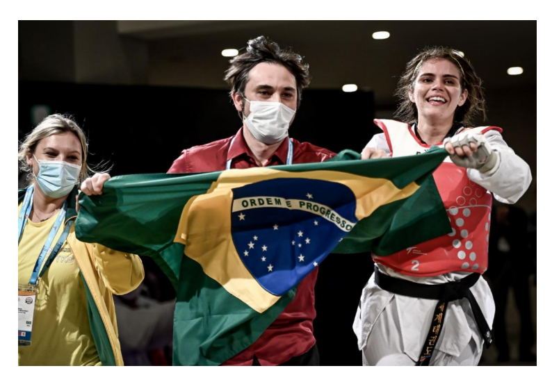
Paralympic Games in women's -58kg K44 event.

We hope to see more para-athletes at the German Open Poomsae 2024.